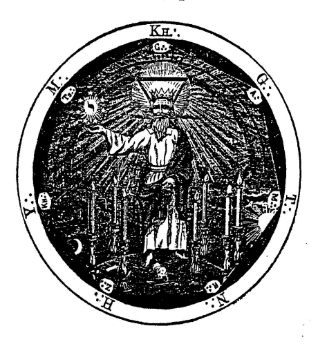
Plat no. 1

Two ideas do play a prominent role in his lecture.