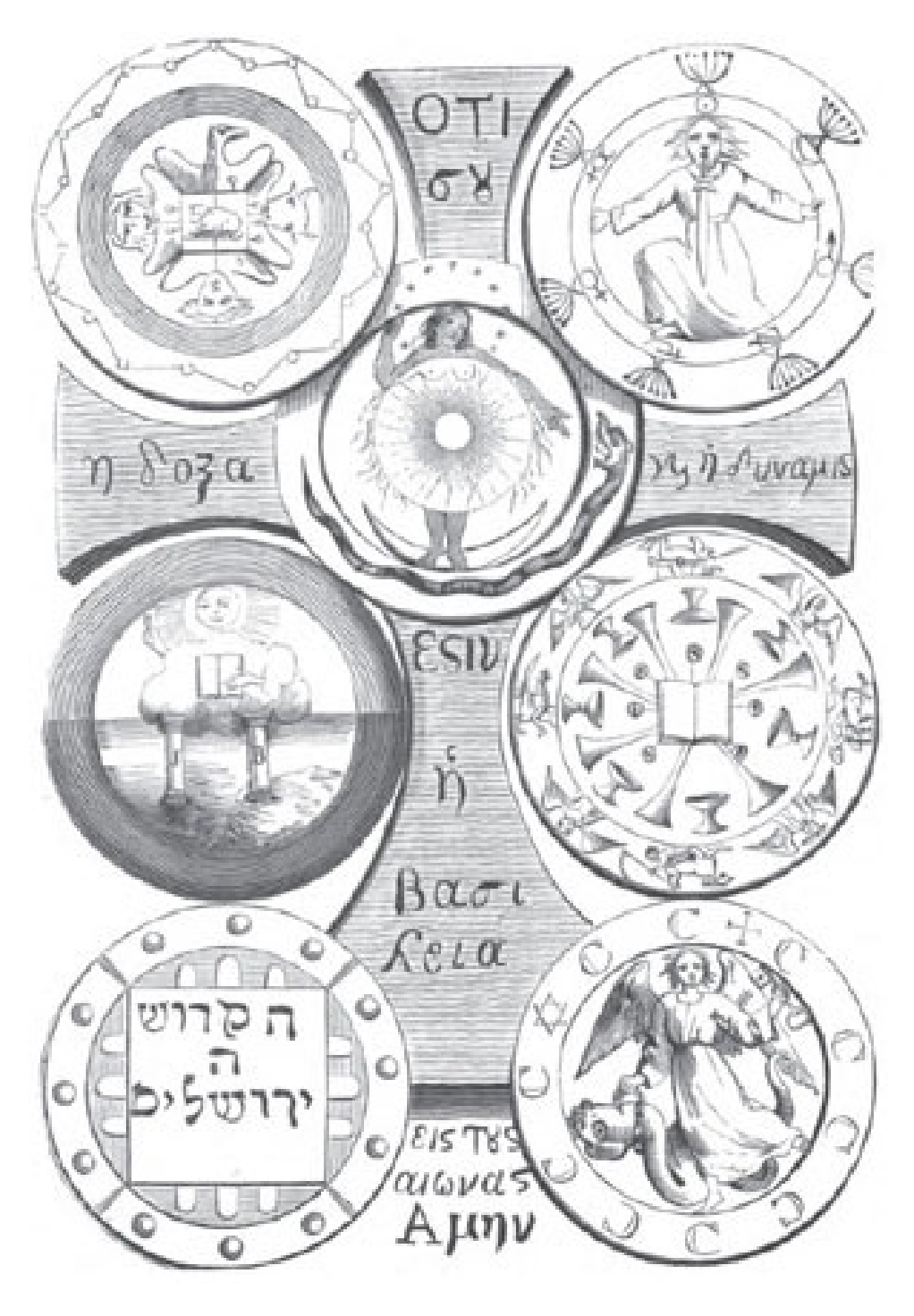
plat no. 2