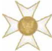
Order of Malta