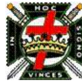
Order of the Temple

As I have gone through these degrees there were No Improper oaths, or any other improper conduct. Just some good clean story telling and knowledge passed along.