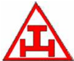
The Capitular Degrees