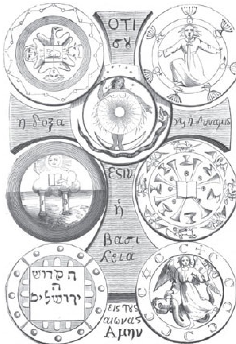
plat no. 2