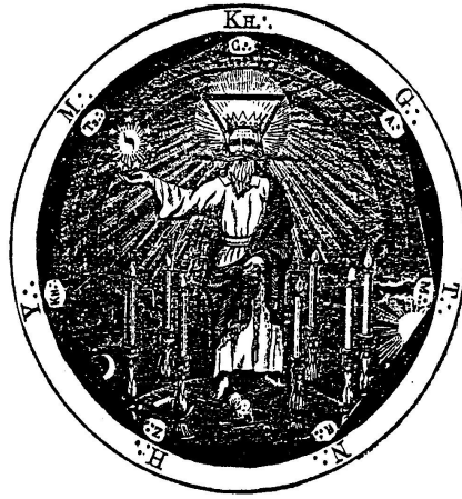
Plat no. 1

Two ideas do play a prominent role in his lecture.